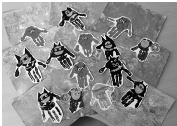
YTSD Super Kids rocked Junior Aces Summer Camp on the courts and in the classroom!!! Program held at the Barnes Tennis Center.