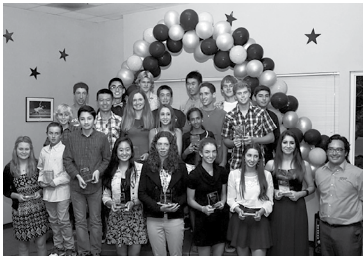
Award winners with presenting Junior Player Council members.