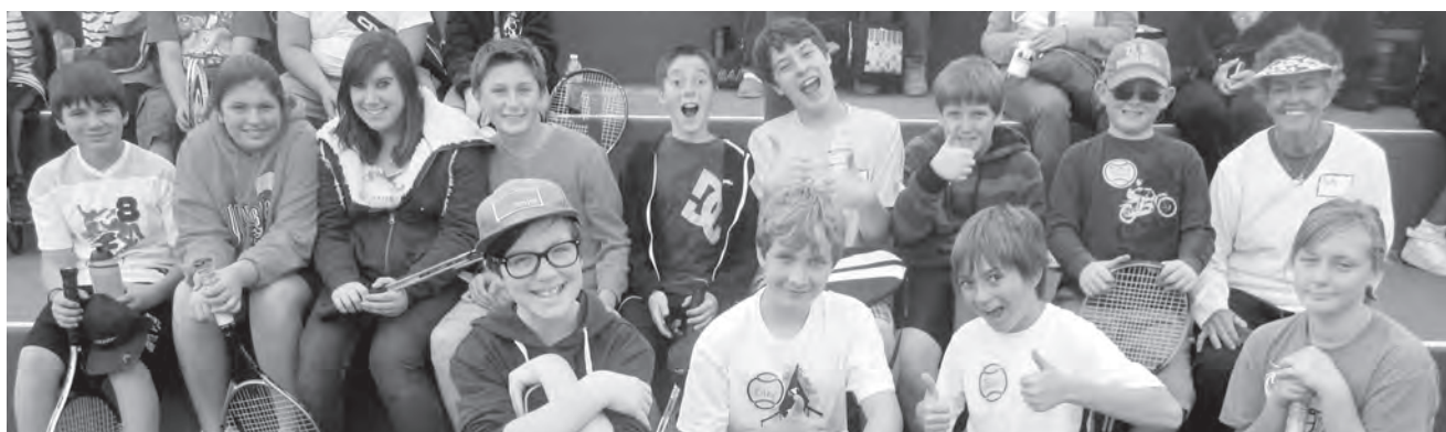
UPPER RIGHT: Happy AST students taking a break